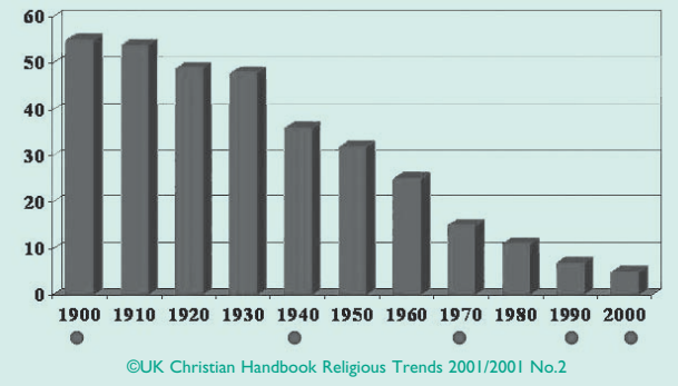
Percentage of child population in Sunday School UK, 1900-2000

Mission-shaped Church (MSC) makes clear on pages 36-41 that there are different “tribes” in the UK cross-cultural mission field we face today and they need different approaches. This graph, borrowed by MSC, shows the proportion of the population who have any kind of church experience is diminishing as Sunday school rolls continue to fall. So those who can be invited to return to hear the story they once knew amount to a shrinking pond. The invite “come back to church” is bait that less and less fish will want to bite.