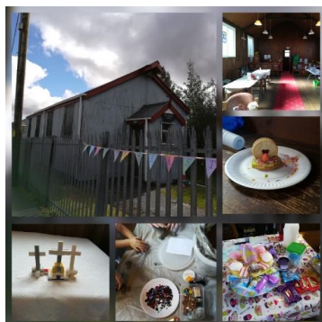
Banwen Messy Church